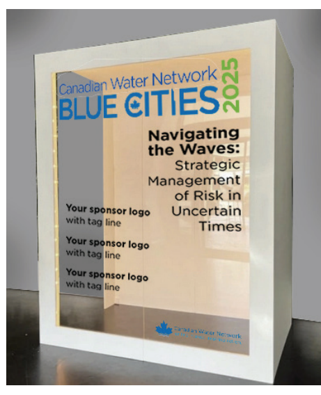
Magazine Photo Wall Actual unit may be different