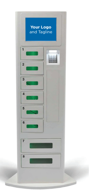
Charging Station Actual unit may be different